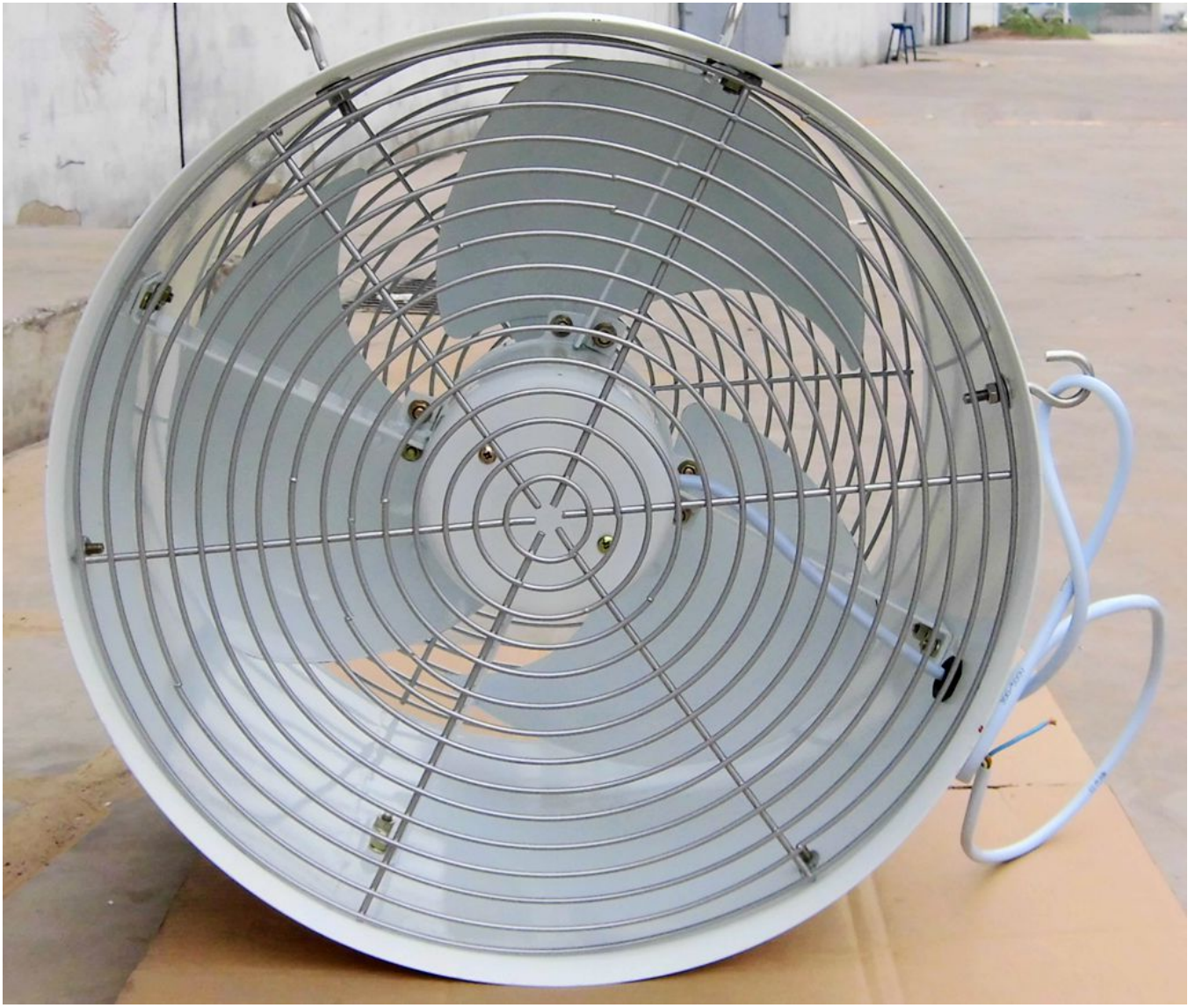
Excellent Anti-corrosion, Plastic Coated Galvanized Plate